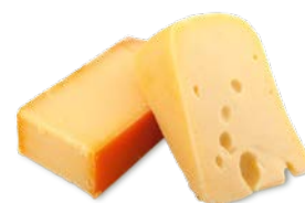
pH Determination in Hardened Cheese