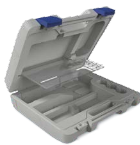
uGo™ Carrying Case