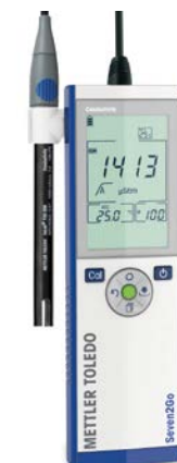
S8 pH/Ion Professional Meter

1 ATC / MTC: Automatic / Manual Temperature Compensation